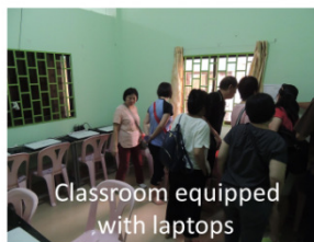
Classroom equipped with laptops

We would like to give thanks to God for the smooth clearance at the Cambodian custom (all the stuff we brought along was allowed through without any problem), fine weather