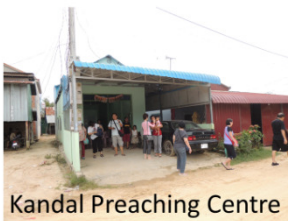
Kandal Preaching Centre

The present trip is therefore my second time to Cambodia, but it is my first time to Kandal preaching centre and Tang Krang community centre, two different parts of the country. Except for me, the rest of the team were all first-timers to Cambodia. Everyone had their own worries about the trip – about cleanliness, cultural difference, language barrier, etc. Whatever concerns on our minds, all of us still managed to go ahead.